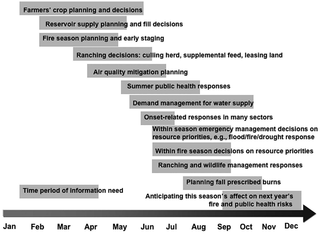
FIG. 3. Annual decision calendar for monsoon applications. This calendar is a framework for assessment scientists to link user needs to potential uses of forecasts and information products. Shaded bars indicate the timing of information needs for planning and operational issues over the year.

summary articles written for nonexperts on recent research (e.g., Cavazos et al. 2002; Comrie 2003). Articles on how the monsoon influences drought and fire risk, for example, will help improve stakeholders' understanding of climate influences on their activities. The product should take advantage of improved understanding of how to improve communication of climate information, for example, the need to avoid technical jargon; include simple or easily accessible ancillary information such as a legend, definitions of terms, or units (e.g., mm or in.); and to explain probabilistic information (e.g., Hartmann et al. 2002a).